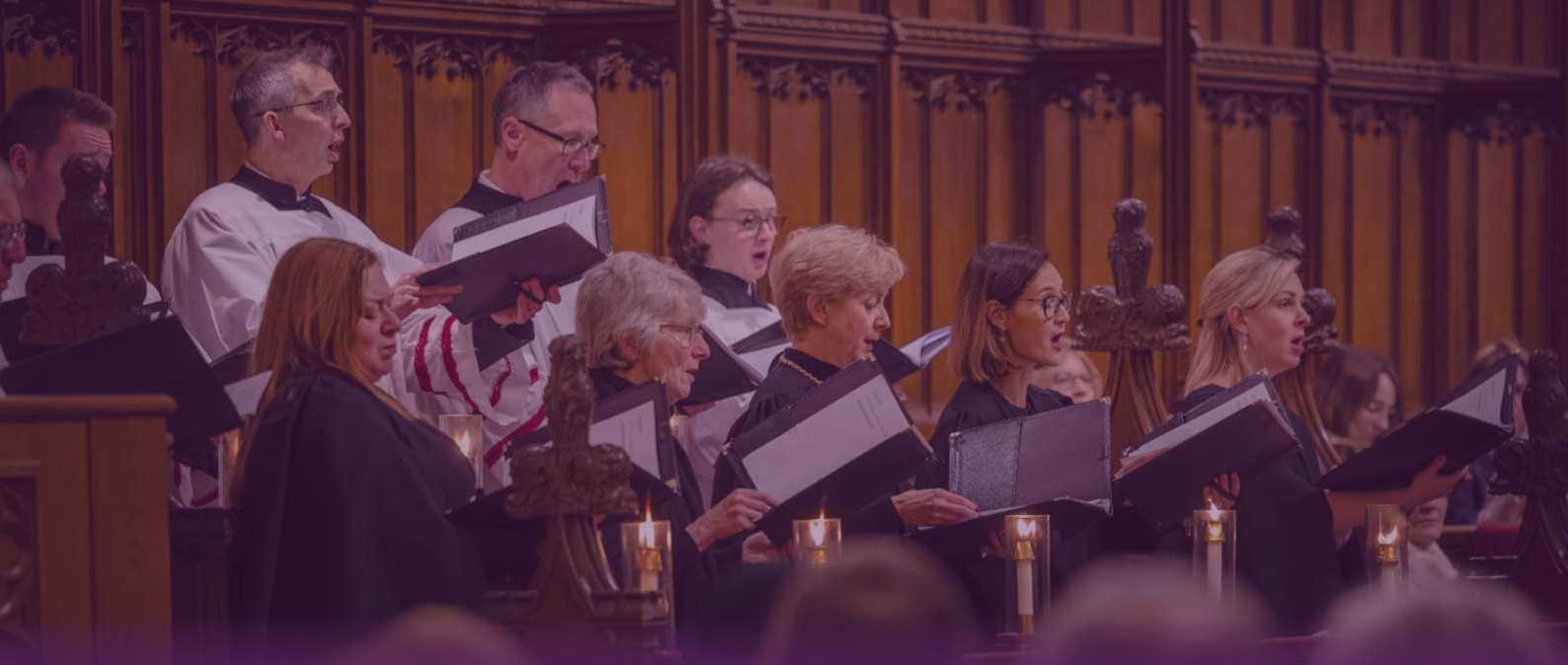
Festival Carol Service, December 2022