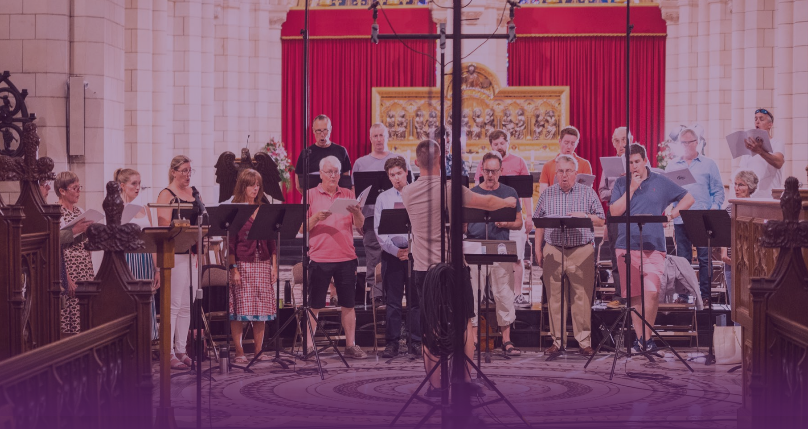
The choir recording a CD of music for Our Lady of Buckfast, September 2019